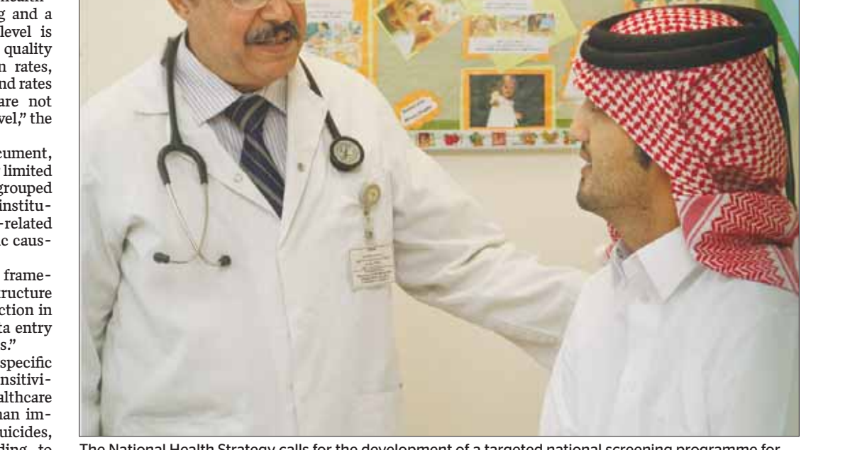
The National Health Strategy calls for the development of a targeted national screening programme for chronic diseases such as diabetes, cardiovascular conditions and breast cancer.

"Accurate, comprehensive data across all categories of healthcare metrics are not available in Qatar as causes of death are not recorded accurately on many occasions, a complete picture of national healthcare expenses is missing and a breakdown of activity level is not available; healthcare quality metrics like readmission rates, hospital infection rates and rates of return to theatres are not tracked at the national level," the